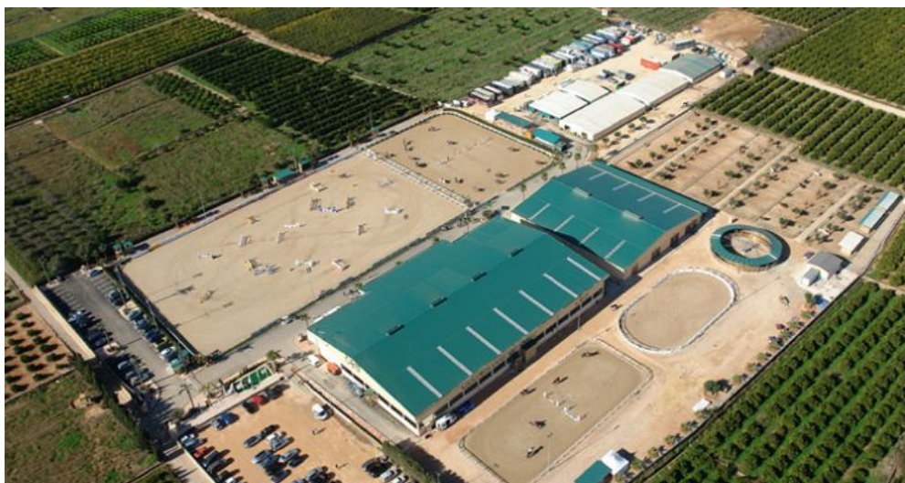
CENTRAL MEETING POINT FACILITIES